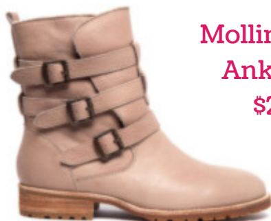
Mollini Rowens Ankle Boots $249.95