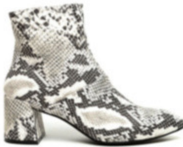
Therapy Sidney Ankle Boots $89.95