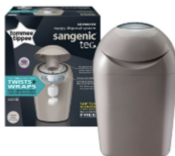
Tommee Tippee Sangenec TEC Nappy Disposal Bin Unit - Grey $59