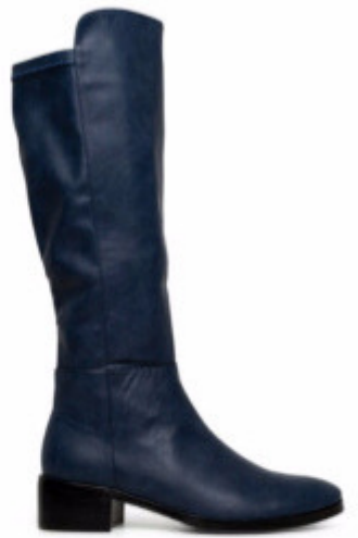
I Love Billy Telli Boots Long $139.95