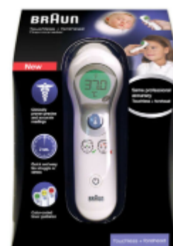
Braun Thermometer Touchless and Forehead $89.30

Wipeable feeding seat and washable tray for easier cleaning.