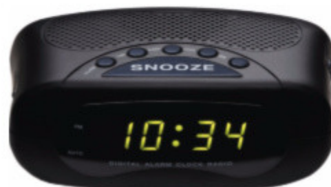
Lenoxx CR21 Clock Radio AM/FM $15