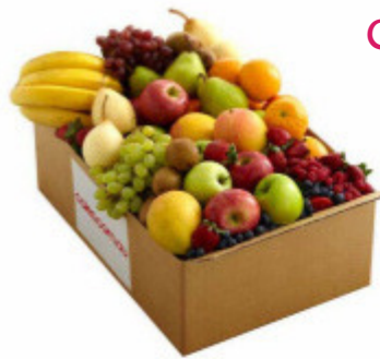
Coles Seasonal Fruit Box Large $50