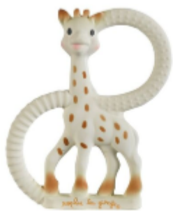
Sophie the Giraffe $26.95

The first teething ring made from 100% natural rubber.