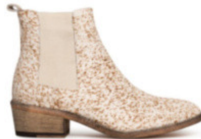
Mollini Zallas Cream Caramel Ankle Boots $199.95