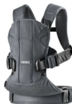
Baby Bjorn Baby Carrier One Air - Anthracite Mesh $249.95