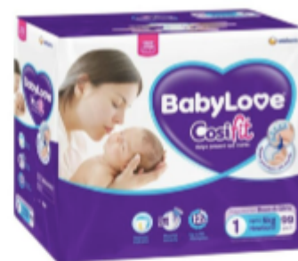
BabyLove Nappies Newborn Jumbo - 99 Pack $26.99