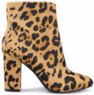
Peppa Ankle Boot $109.95