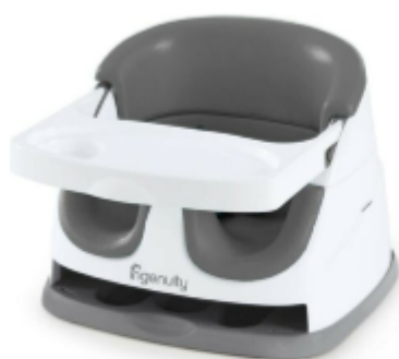
Ingenuity Baby Base 2-in-1 Seat - Slate $59

Wipeable feeding seat and washable tray for easier cleaning.