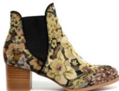
I Love Billy Jarma Ankle Boots $99.95