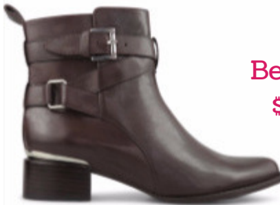
Benj Boot $99.95