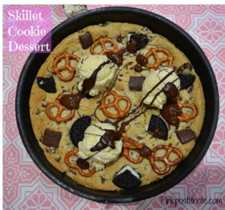
Skillet Cookie Dessert